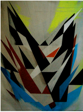
”Superstrellas Series” Acrylic on canvas, 35 x 45cm (2007)