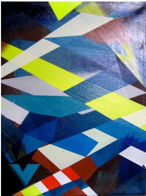
“Superstrellas Series” – Acrylic on canvas, 35 x 45cm (2007)