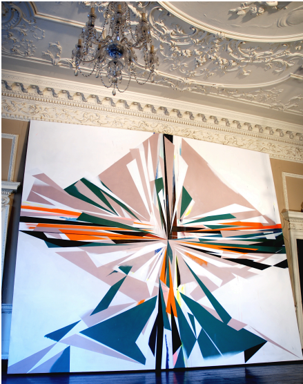
‘Superstrellas series’ – Acrylic on canvas, 350 x 350cm (comprises 4 square canvases) Exhibited at Riflemaker Soho Square (2007)