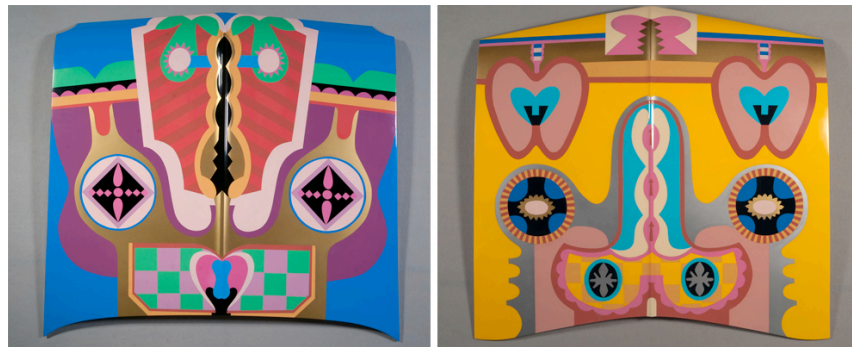
Birth Hood and Bigamy Hood (1965)

revolutionary times. Her highly personal body of work includes paintings, tapestries, sculpture and mixed-media installations, the best known of which is The Dinner Party ; a symbolic history of women in western civilisation with thirty-nine place settings arranged as a ceremonial banquet. The work is seen as a milestone in twentieth-century art and is the permanent centrepiece of the Elizabeth A. Sackler Center for Feminist Art at the Brooklyn Museum, New York.